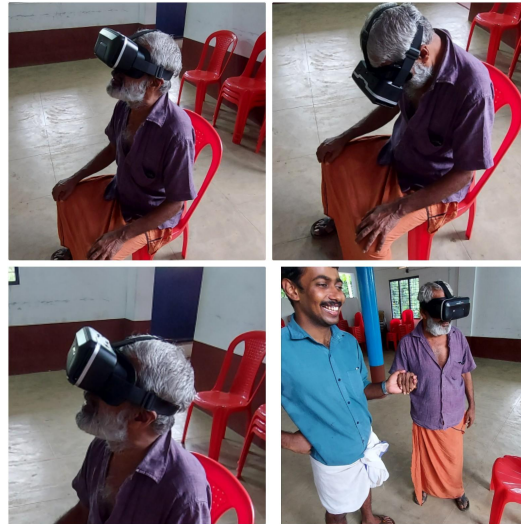
Figure 3. This participant was aged 65 years, he was asked to walk with the HMD on his face to experience the 360 degrees. At this stage, he faced little dizziness and motion sickness, he took help from another participant to hold his hand.