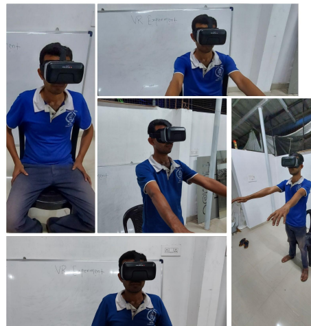
Figure 1. Experiencing the performance in 360 degrees

An experiment was conducted to study the immersive virtual environment experience of the audience for the Redbeard festival performance. The performance was recorded in Insta 360 camera, they are designed to shoot high-resolution content specially designed for Virtual reality (VR) or 360 degrees and projected the visuals in a Head-Mounted Display (HMD). HMD immerses the user into the virtual world, this headset consists of two small high-resolution LCDs ( Liquid Crystal Display) or OLED ( Organic Light Emitting Diode) or monitors which provide different images for each eye in a 3D graphics virtual environment. HMD contains three focus adjustment buttons (Right, Centre & Left), which can be adjusted to the participant's eye power.