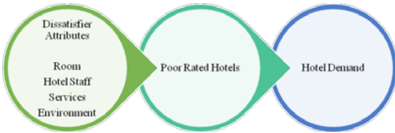
Figure 1: The Conceptual Framework of the Research

dissatisfaction of customers in their experience with the hotel. The dependent variables are to show the relationship between hotel ratings and hotel reservation.